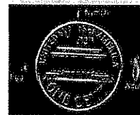
Size of nits and lice compared to a penny