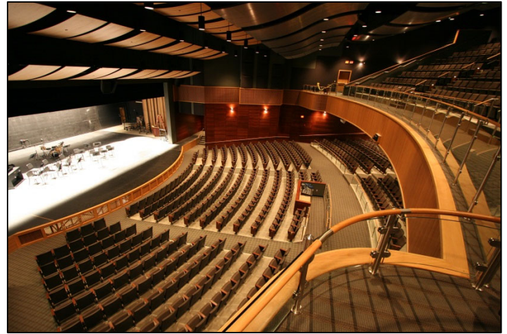
Indian Trail Auditorium