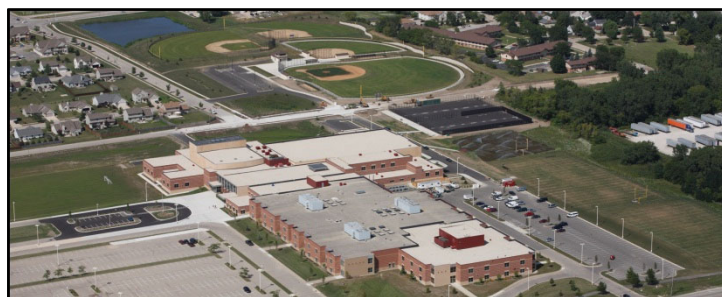
Baseball & Softball Fields at Indian Trail

AN ADDITIONAL $100 CLEANING FEE WILL BE CHARGED IF THE ORGANIZATION DOES NOT CLEAN UP AFTER USING THE RENTED FACILITIES (REFER TO REGULATION 16 LISTED ABOVE)