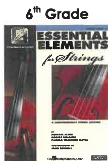
Essential Elements for Strings, 2