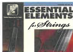
Essential Elements for Strings, 2