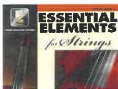
Essential Elements for Strings, 1