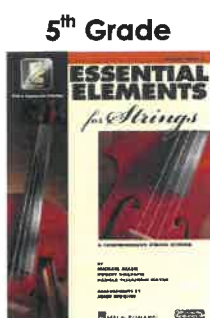
Essential Elements for Strings, 1