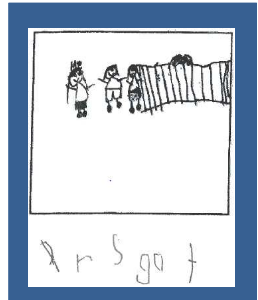
The picture tells the story