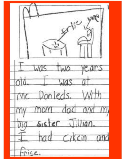
The story is told with pictures and some writing.